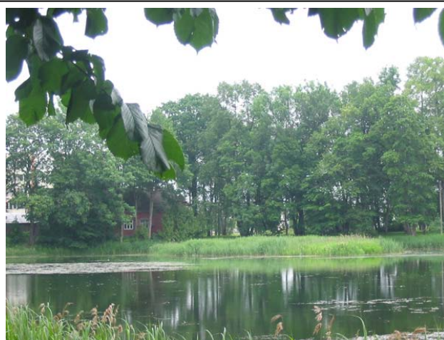
Cirava Manor park