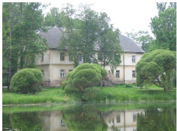
Cirava Manor Doctor's House