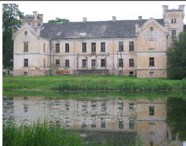
Cirava Manor Castle